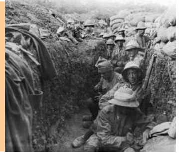
Trench conditions WWI

Structure: The poem uses a large amount of ellipses , caesuras and repetition to create an on-going sense of waiting and boredom. The poem is made of eight stanzas with a consistent use of a half line to end. This reinforces the sense of stasis or sameness throughout the poem that nothing is happening. There is use of para-rhyme showing words which appear to rhyme yet sound wrong when read to create the sense of unsettledness in the poem the soldiers are feeling. Owen also uses a huge amount of onomatopoeia and alliteration in the poem to emphasise the atmosphere and the sound of weather.