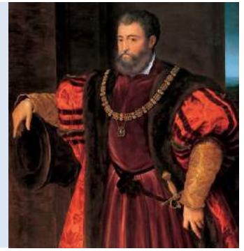
Alfonso Duke of Ferrara

The poem is loosely based on the Duke of Ferrara and is written from his perspective, talking to a messenger about arranging his next marriage. The assumption being that he was dissatisfied with his former wife and had her killed.