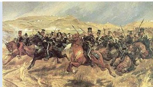
Painting of the light brigade

During a battle, a miscommunication sent the light brigade charging head first into the cannons of the other side, it was a huge catastrophe and many died. It showed to the British that even mistakes can happen. The men were respected for following orders, even though they knew they may be wrong. Some however have criticised the way they blindly followed orders. Lord Tennyson was the poet who was asked to write about their glorious sacrifice.