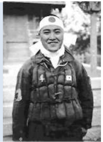
Kamikaze pilot before mission.

The poet questions at the end which death would have been better, to die as a kamikaze pilot young or to grow old with a family who shut you out.