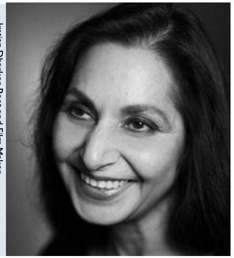
Imtiaz Dharker Poet and Film Maker

In short, that the world would be better if it shared more qualities with 'tissue'.