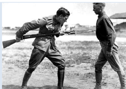
Soldiers bayonet training

The poem is about a nameless soldier going over the top in the trenches. Soldiers would have bayonets attached to the end of their rifles and would use them to stab enemy soldiers. The nameless soldier in the poem seems to become more a weapon than a man, rushing toward the enemy. It is not clear at the end whether he dies but there is definitely a change in him. His actions are very raw and primal, much like an animal, suddenly pausing, preparing to react. The poet, Ted Hughes, was a former RAF serviceman and includes a great amount of natural and historical ideas in his poems and he often looks at man's impact on nature.