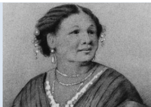
Mary Seacole, one of the many figures named in the poem.

Noticeably the poet emphasises how we often celebrate our national or cultural history, without looking at the history and culture of those we were in conflict with.